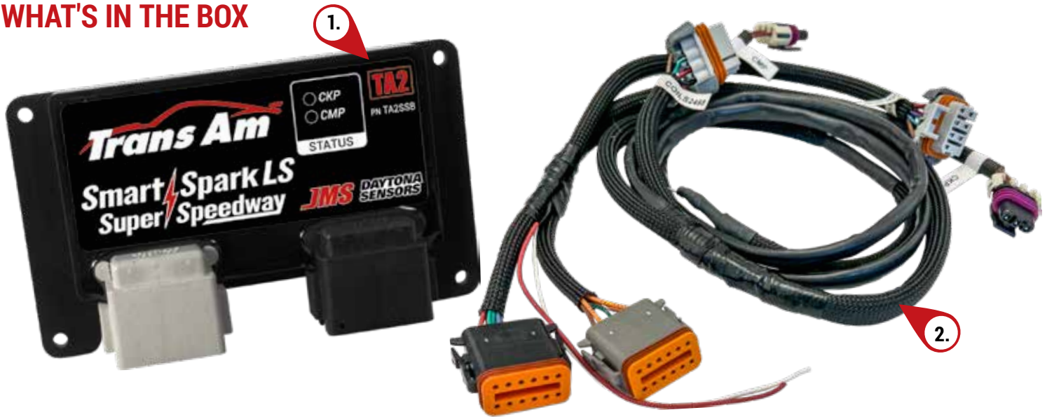
1. Smart Spark TA2 SS Controller (P/N TA2SSLS-B)